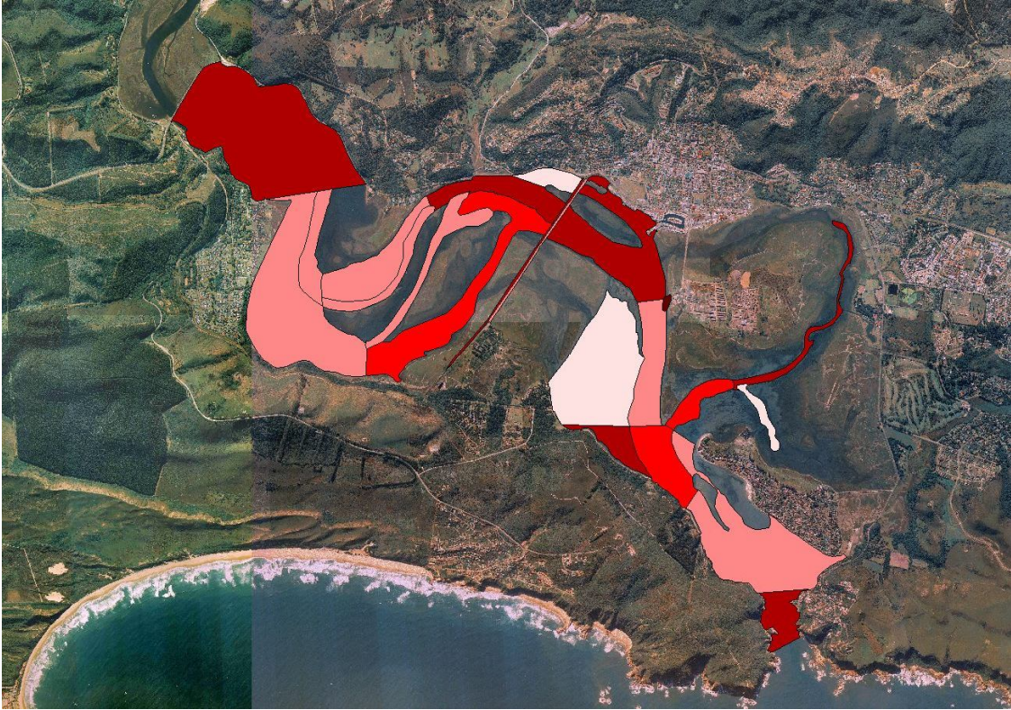
Figure 3: Spatial distribution of observed angler effort, all sectors combined between June 2008 and May 2009. Darker colouration represents higher effort. Actual numbers not displayed.

So how does the Knysna fishery compare to other estuarine fisheries in the Garden Route? Due to its size one would expect there to be more fishing effort on Knysna but just how much? Well the Swartvlei estuary, sampled during the same period, had an estimated yearly angling effort of 48 049 angler hours in the first year which decreased to 35 363 hours in the second. The drop in effort during the second year period has been attributed to the closed mouth state. The Keurbooms estuary, which we surveyed in 2003 to 2004, had an estimated total effort of 65 848 angler hours. So in other words the total estimated effort on Knysna is more than double that of Keurbooms and almost triple of that on Swartvlei! It is a busy estuary.